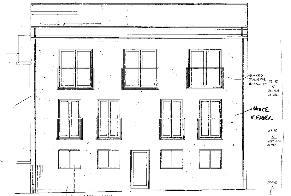
PROPOSED REAR 1:100

PROPOSED APARTMENTS, 100-101 GREENS PLACE, S. SHIELDS FOR MR. PULLEN DRG NO 4 REV. A. - ELEV. - 4/11/15 C - DITTO 29/11/15 E - MATERIALS 8/12/15 B - ELEV. - 8/11/15 D - LEVELS/HTS - 30/11/15